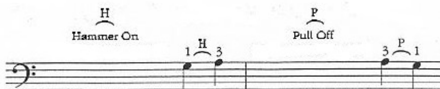
Ilustração 6: Hammer On e Pull Off

Em relação ao uso da mão direita, existem diversas formas de tocar o instrumento. Para tocar Jazz, a primeira técnica a ser empregada foi a adaptação do pizzicatto do contrabaixo acústico ao contrabaixo elétrico. Para realizá-lo é preciso fazer soar a corda com os dedos indicadores e médio da mão direita ao mesmo tempo. Em passagens onde é necessário mais velocidade, alternam-se os dedos. Mais recentemente, baixistas passaram a utilizar três dedos – indicador, médio e anular – em alguns trechos ou efeitos, como a execução rápida de tercinas.