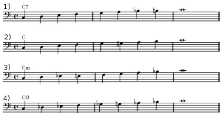
Ilustração 2: Escalas BeBop

Alguns procedimentos típicos podem ser avaliados quanto ao uso das escalas. Como por exemplo, as chamadas escalas BeBop: